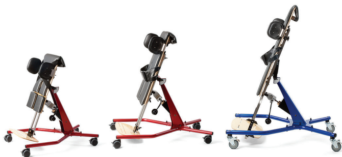
All three sizes are available in red or blue.