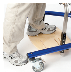
When the stander is vertical, the footboard is almost at floor level, making transfers easy.