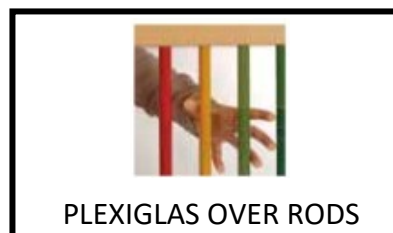
PLEXIGLAS OVER RODS