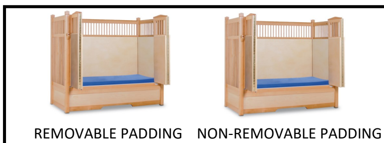
REMOVABLE PADDING NON-REMOVABLE PADDING