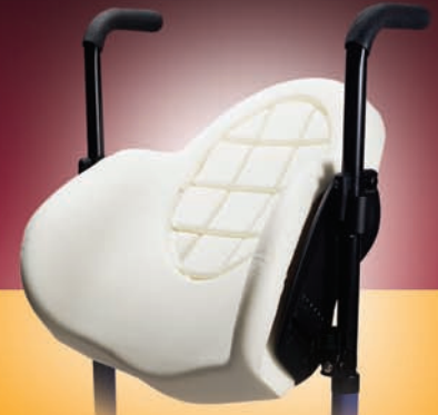
SADMERC Code: E2615

Includes an ABS plastic back shell, soft segmented contoured back foam, built-in lateral support and universal mounting hardware.