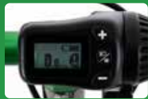
Digital LCD display