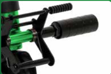
Supplemental foot brake