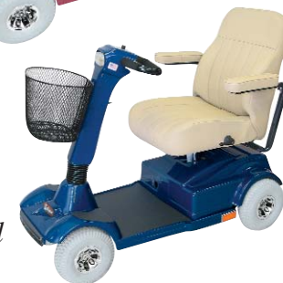
Shown with optional Admirals Seat

“I sell several [scooter lines], but the scooter that I have used for the past twelve years is a PaceSaver”.