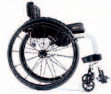
XENON 2 FIXED FRONT THE LIGHTEST