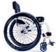
XENON 2 HYBRID (DUAL TUBE) THE STRONGEST