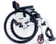
XENON 2 SWING-AWAY THE ALLROUNDER