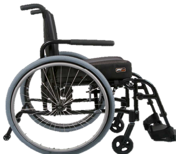
Quickie QXi, Ultra Lightweight Adjustable Folding Wheelchair