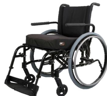
Quickie QXi featuring the Jay ION™ cushion