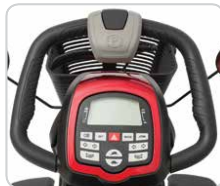
Full steering wheel with integrated digital display