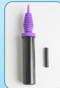
Hand Pump & Adapter