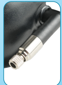
Heavy Duty Steel Valve