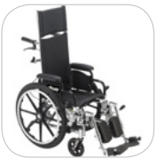
Lightweight 24" Mag-style Rear Wheels