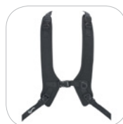
Backpack Style Chest Harness