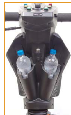
Water bottle holders for cold beverage bottles only. Removable for easy cleaning.