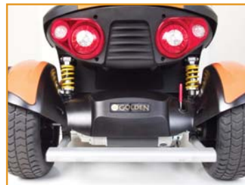
Full front and rear lighting package standard