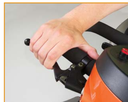
Hand brake standard