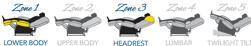
LOWER BODY UPPER BODY HEADREST LUMBAR TWILIGHT TILT

THE HALO provides ergonomic placement of your lower body allowing muscles to relax, while a power adjustable headrest and footrest extension refine long-lasting comfort with minimal effort.