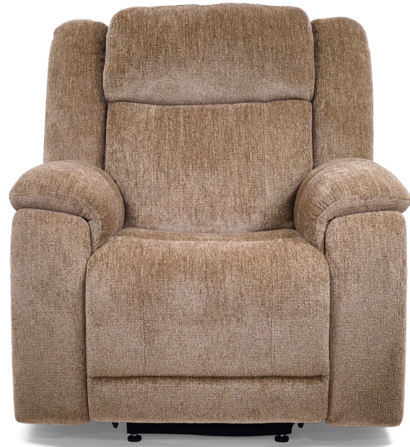
Shown in Sand