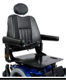
Fig 1.2 Pulse™ 5 BC Capt Back and Solid Seat Pan