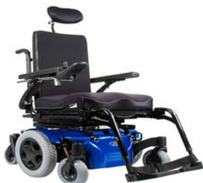
Fig 1.1 Pulse™ 5 BC