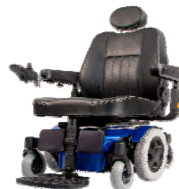
Fig 1.3 Pulse™ 5 CC