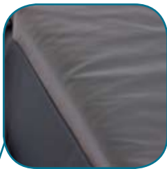
RF welded seams