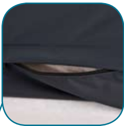
Three-sided zip and inside flap