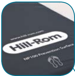
Product identifier and foot indicator