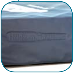
Embossed manufacture date