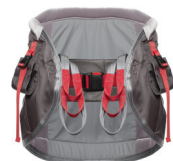
ThoraxSling, with seat support