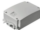
N111 Battery Backup