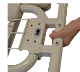
42" Width Expansion