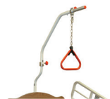
Trapeze Patient Helper