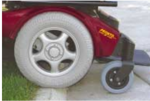
SureStep design flexes to maintain drive-wheel traction while driving over transitions.