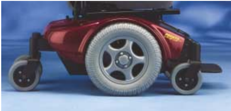
Six wheels remain on the ground for maximum stability, providing a true center-wheel drive position for improved maneuverability and accessibility.

Center-wheel drive positions the drive wheels directly beneath the consumer's center-of-gravity, providing a much more intuitive driving experience and a tight overall turning radius of 21.5" for accessibility.