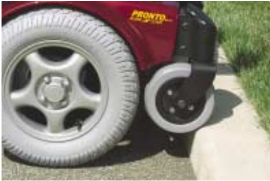
Front casters automatically lift up to accommodate transitions up to three-inches for a smooth and controllable ride.

SureStep technology provides optimum traction and stability as the Pronto M91 drives over transitions and thresholds of up to three inches or negotiates uneven terrain. The high torque of the motors lifts the front casters to accommodate changes in height for a smooth, less jarring ride over rough surfaces. SureStep technology allows six wheels to remain in contact with the ground to maximize performance, improve stability and enhance comfort for a more controllable power chair.