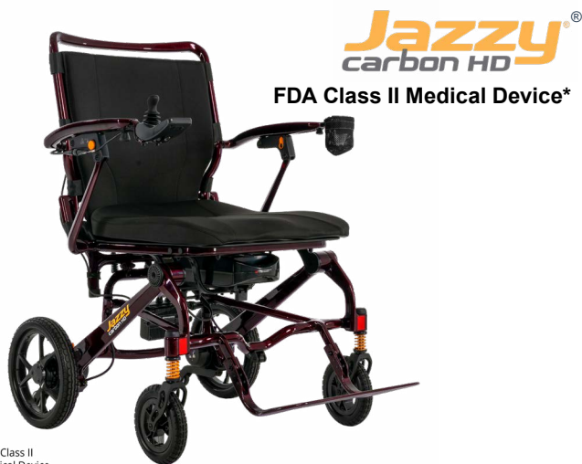
FDA Class II Medical Device