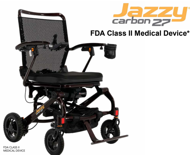
FDA Class II Medical Device*