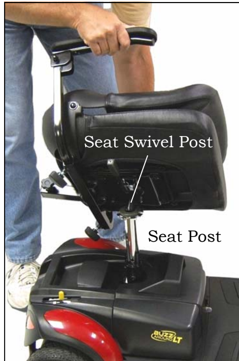
Figure 23. Installing the Seat