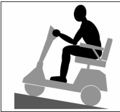
Figure 2. Going Up an Incline

*Buzzaround Lite maximum recommended incline is 6°.