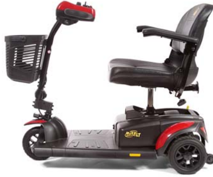
Figure 24. Buzzaround Lite™ (Model GB107)