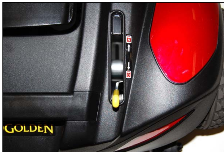
Figure 11: Freewheel Lever (Drive Position)

Your Buzzaround Lite™ is equipped with a freewheel lever that can set your scooter in or out of freewheel mode.