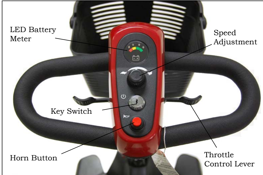
Figure 5. Buzzaround Lite™ Delta Tiller Control Panel