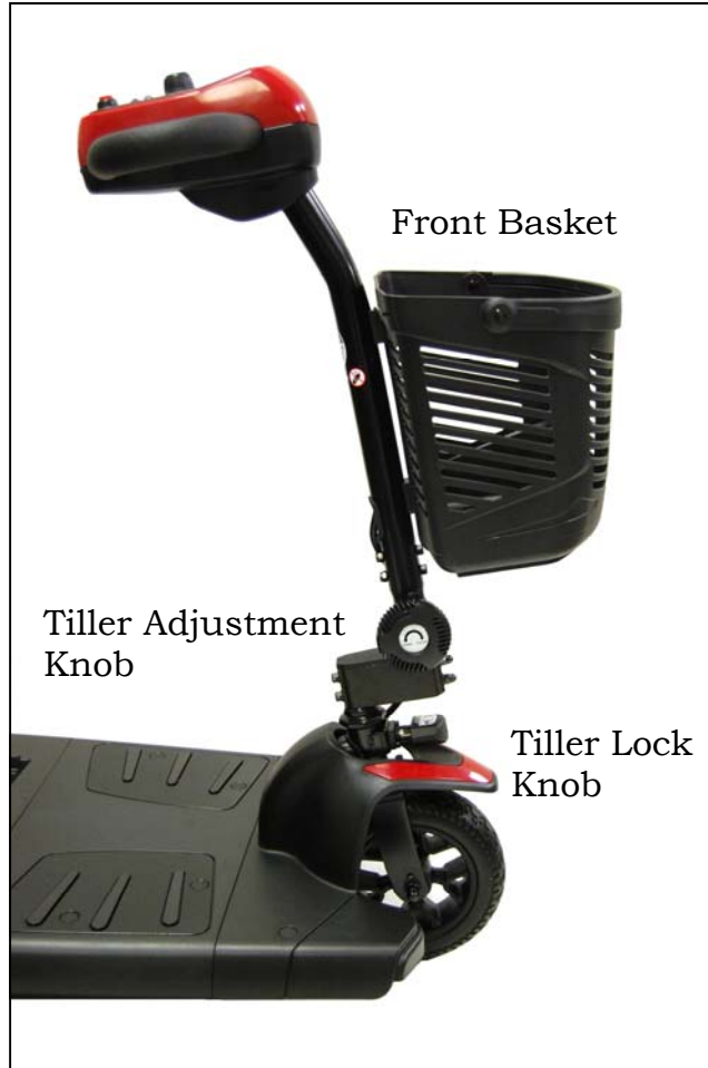
Figure 22. Tiller Raised