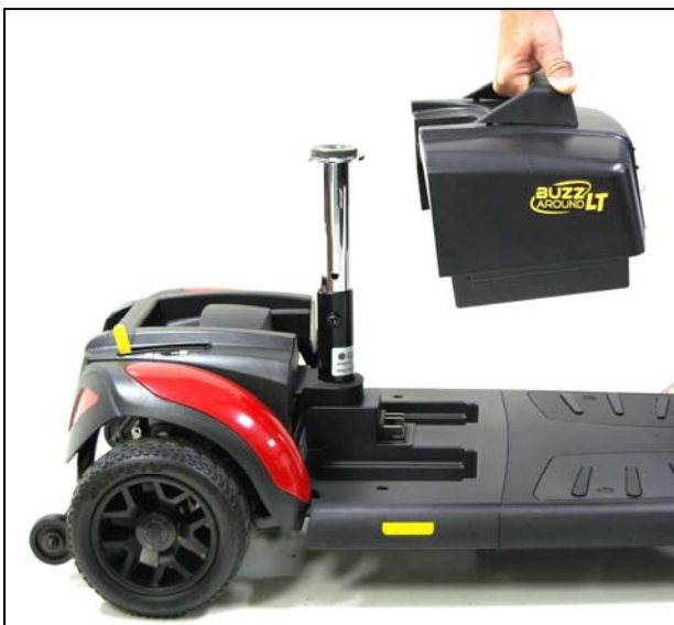
Figure 21. Battery Pack Installation