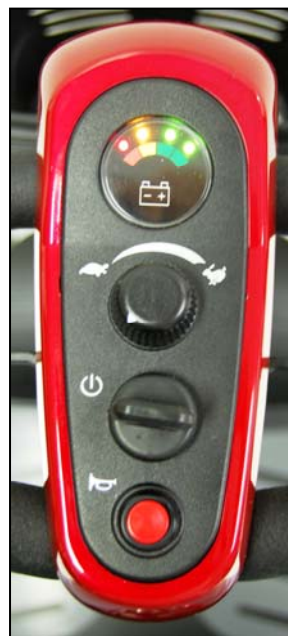
Figure 13. Key Switch (On)