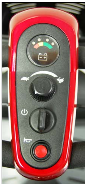
Figure 12. Key Switch (Off)