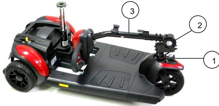
Figure 16. Lowered Tiller

6. Push in and turn the tiller lock clockwise 90 degrees. See #1 on figure 16. This will lock the front wheel to keep it from turning side to side to help control while carrying.