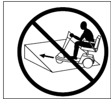
Figure 3. Traversing an Incline