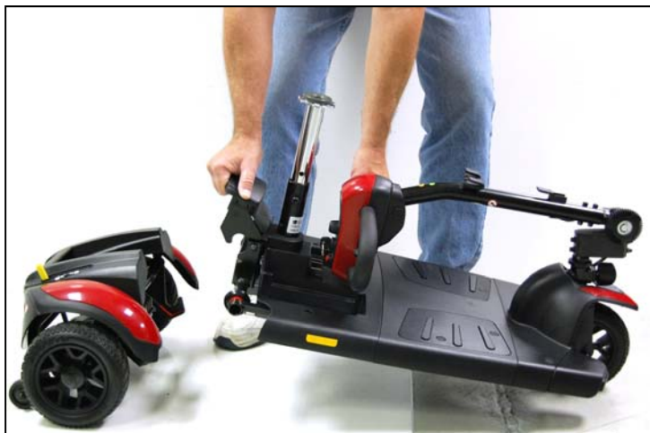
Figure 17. Separating the Drivetrain and Frame

8. Pull the front frame up and off of the drivetrain. See figure 17.