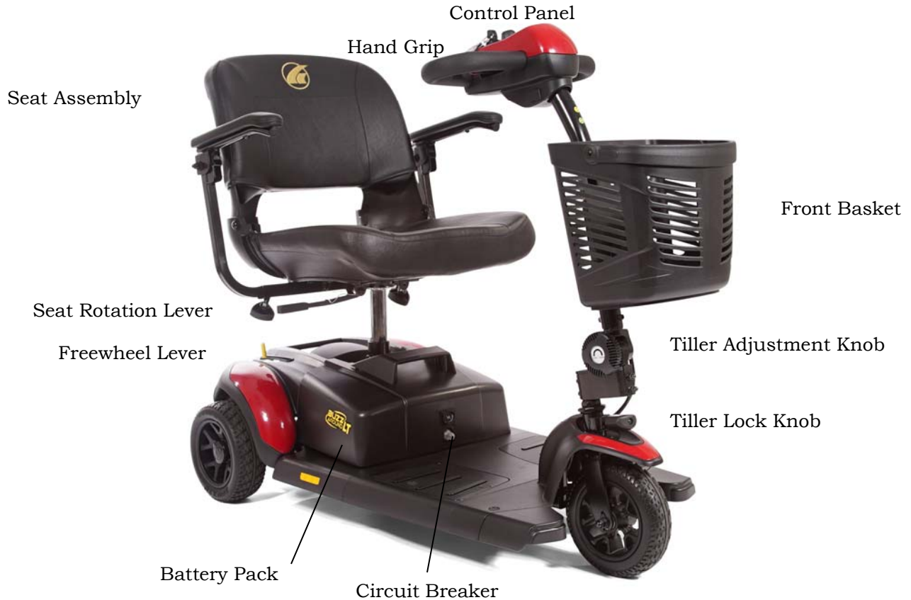
Figure 4. Your Golden Buzzaround Lite™ (Model GB107)