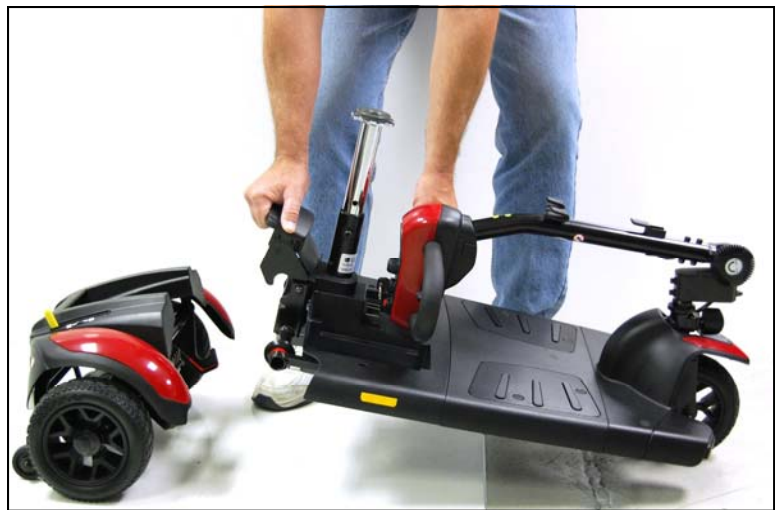
Figure 20. Connecting Frame and Drivetrain