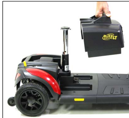
Figure 15. Removing the Battery Pack