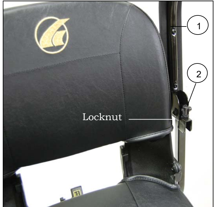
Figure 7. Armrest Angle Adjustment