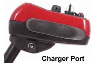
Figure 26. Tiller