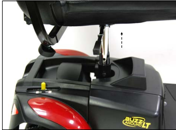
Figure 8: Seat Rotation Adjustment