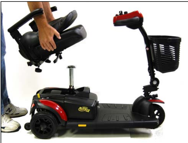
Figure 14. Removing the Seat