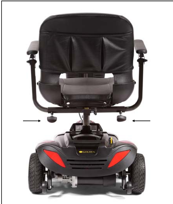
Figure 6. Armrest Width Adjustment