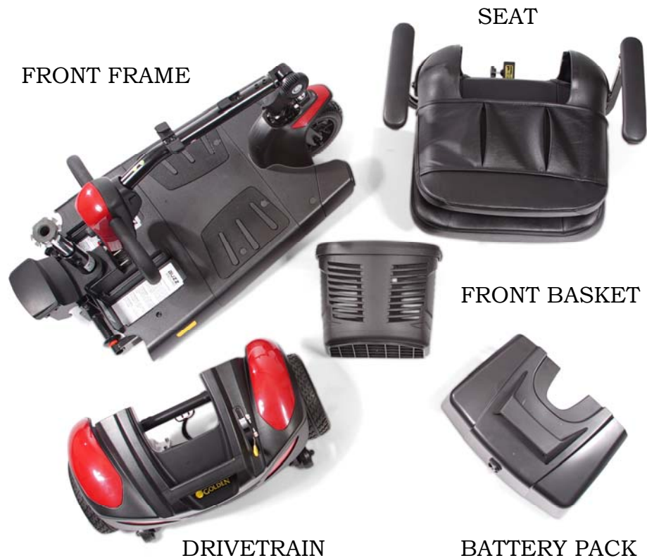
Figure 18. Buzzaround Lite™ Components (Model GB107)

Ensure that all components in the scooter have been correctly assembled. During assembly, please check that all connecting/locking devices are holding in place.