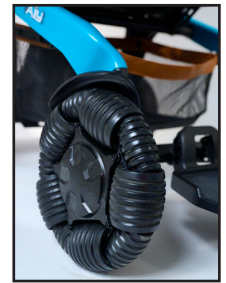
Omni-Directional Front Wheels