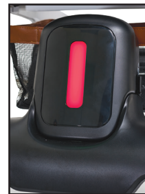
Highly Visible Rear Lighting