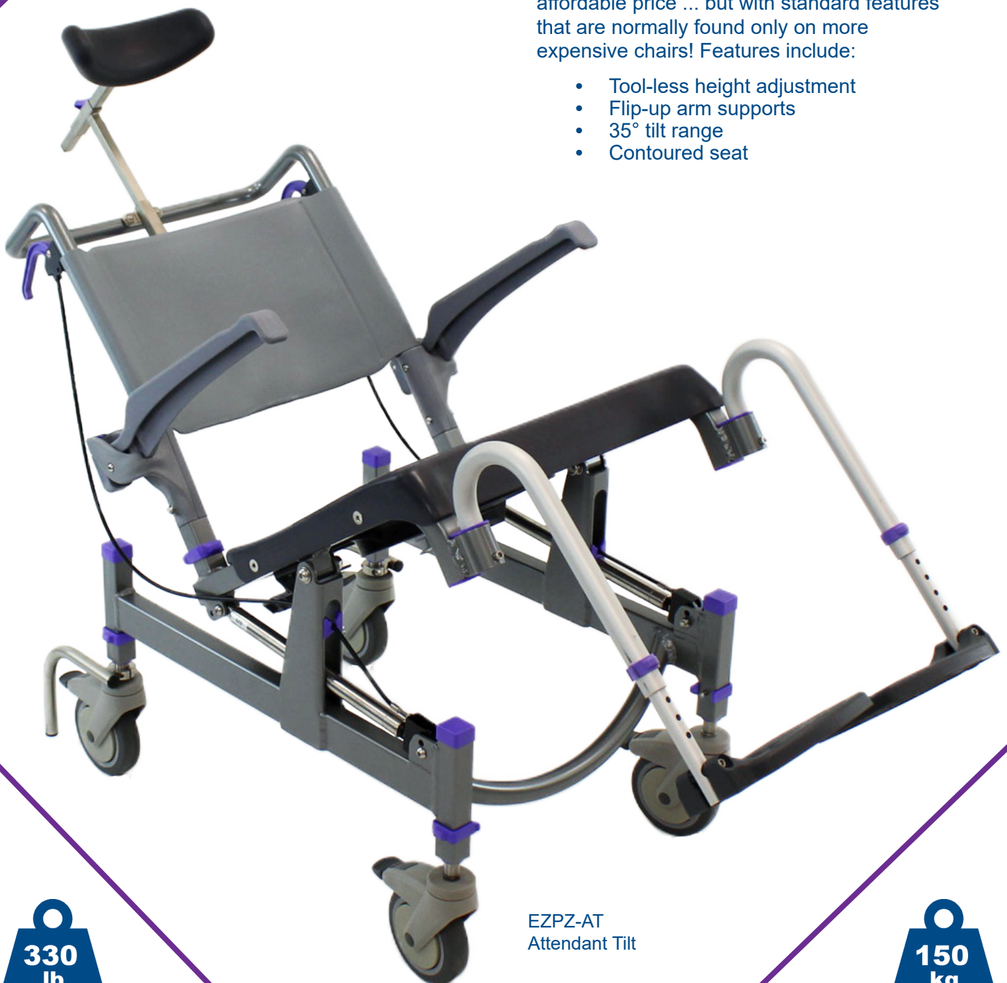
EZPZ-AT Attendant Tilt