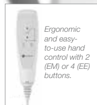
Ergonomic and easy-to-use hand control with 2 (EM) or 4 (EE) buttons.