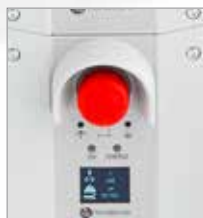
New control box with diagnostics, e.g. lift counter and overload indicator.