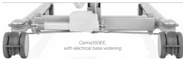
Carina350EE, with electrical base widening