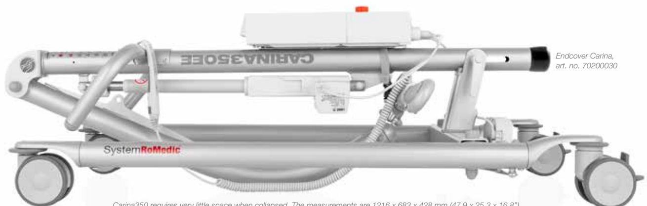
Endcover Carina, art. no. 70200030