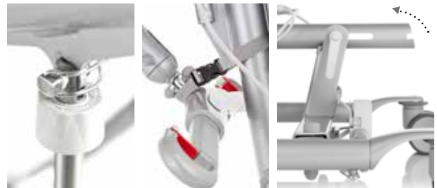
Using a quick-connecting locking pin, the actuator is released from the lift arm.

The lift can be used in all situations, and, when it's needed more elsewhere, it is easy to move between different users, rooms and homes. The lift is delivered collapsed.