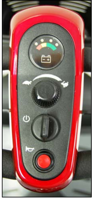
Figure 12. Key Switch (Off)