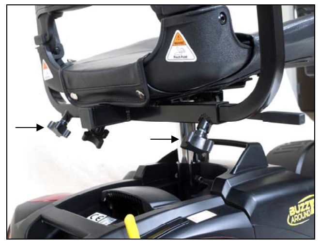
Figure 6. Armrest Width Adjustment