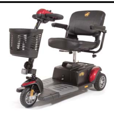
Figure 24. Buzzaround XL<sup>TM</sup> (Model GB117SHD)

NOTICE All Golden Buzzaround XL scooters can be equipped with docking devices for loading onto a vehicle by means of a mechanical lift or hoist. Contact your Golden Technologies, Inc. dealer for more information concerning docking devices and scooter lift devices.