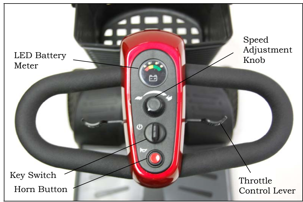
Figure 5. Buzzaround XL<sup>TM</sup> Delta Tiller Control Panel