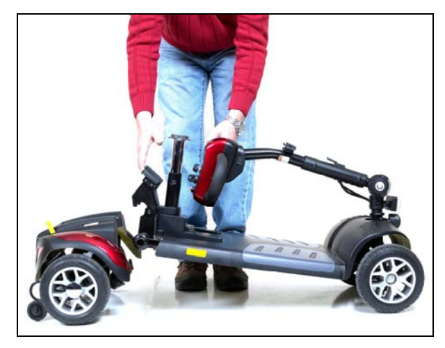
Figure 17. Separating the Drivetrain and Frame