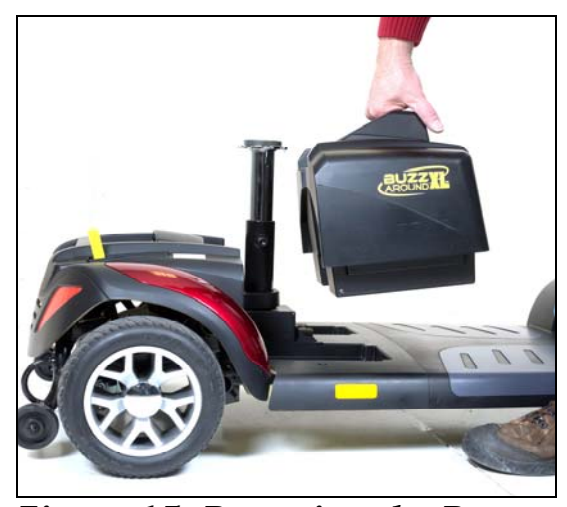
Figure 15. Removing the Battery Pack