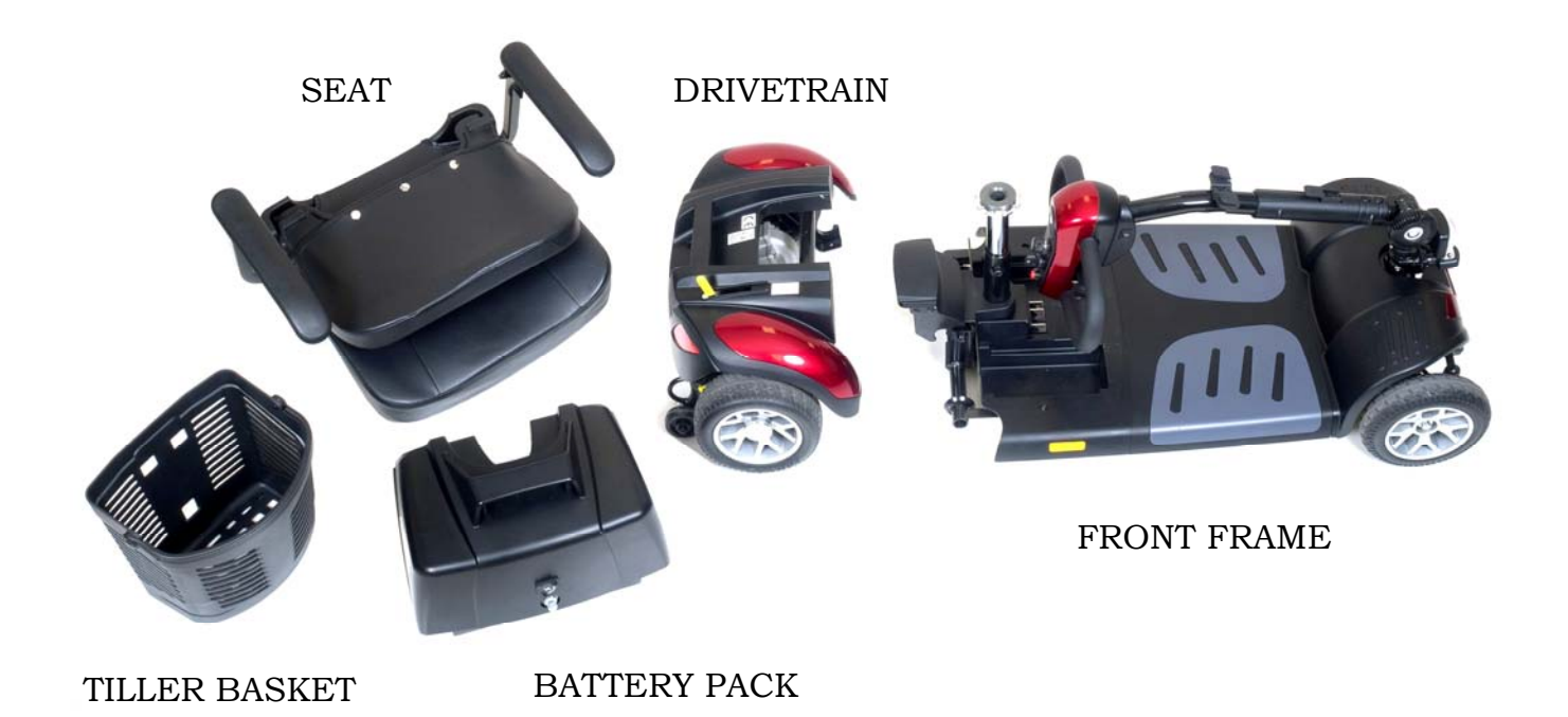
Figure 18. Buzzaround XL™ Components (Model GB147)

Ensure that all components in the scooter have been correctly assembled. During assembly, please check that all connecting/locking devices are holding in place.