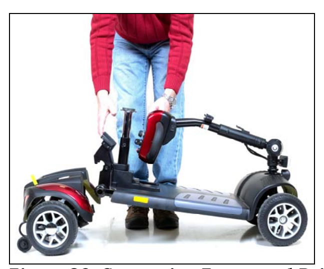
Figure 20. Connecting Frame and Drivetrain