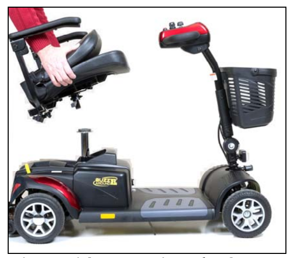
Figure 14. Removing the Seat

3. Grip the seat on opposite sides and, with a firm grip; pull the seat straight up. See figure 14.