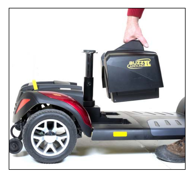
Figure 21. Battery Pack Installation