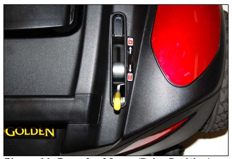
Figure 11: Freewheel Lever (Drive Position)

Your Buzzaround XL™ is equipped with a freewheel lever that can set your scooter in or out of freewheel mode.