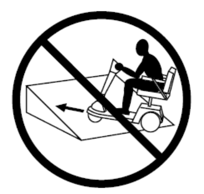
Figure 3. Traversing an Incline

WARNING If, while you are driving down a slope, your scooter starts to move faster than you feel is safe, release the throttle control lever and allow your Buzzaround XL to come to a stop. When you feel that you again have control of your scooter, push the throttle control lever forward and continue safely down the remainder of the slope.