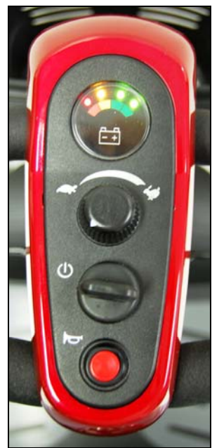
Figure 13. Key Switch (On)