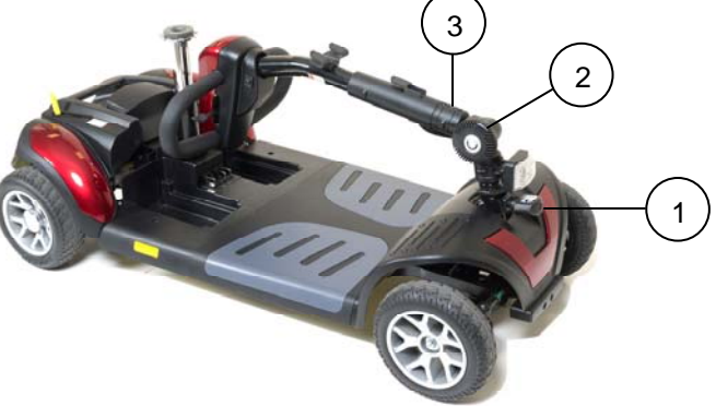
Figure 16. Lowered Tiller

6. Push in and turn the tiller lock clockwise 90 degrees. See #1 on figure 16. This will lock the front wheel to keep it from turning side to side to help control while carrying.