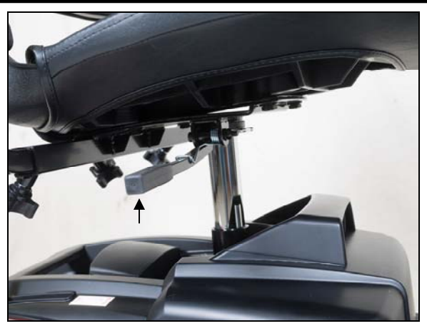
Figure 8: Seat Rotation Adjustment