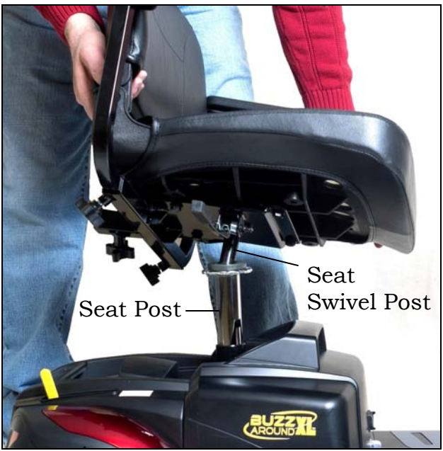
Figure 23. Installing the Seat