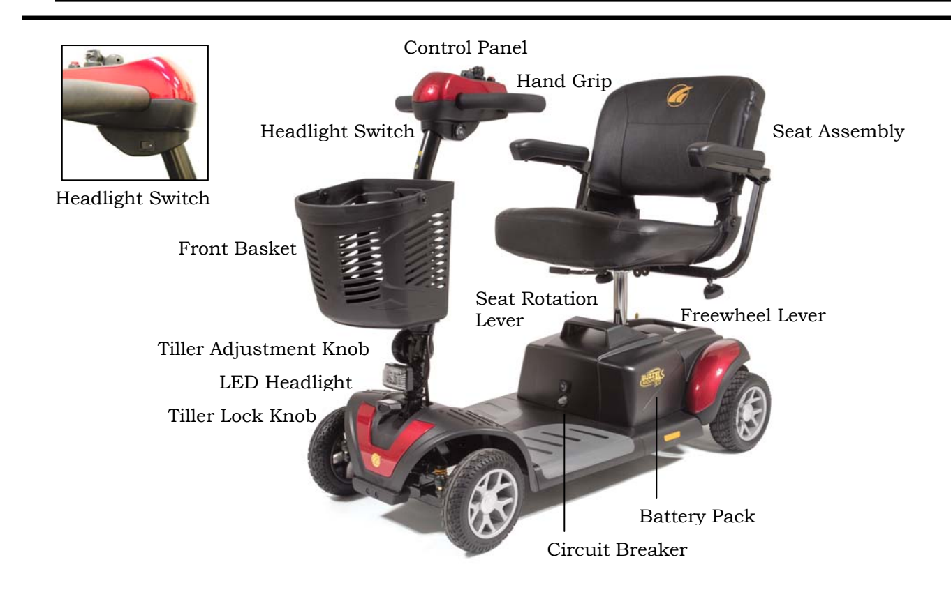
Figure 4. Your Golden Buzzaround XL™ (Model GB147SHD)