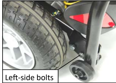
Figure 2: Rear Bumper Installed