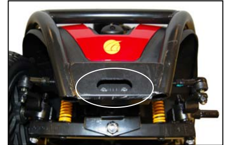
Figure 3: Nose-piece Screws