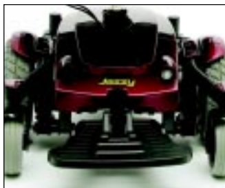
New redesigned foot platform