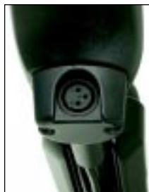
Charger port relocated under controller