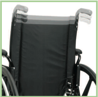
Height adjustable back Included on 4000 models.