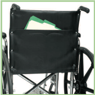
Chart pocket Included on 2000 and 2000HD models.