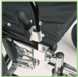
Quick-release flip-back arms Make transfers easy. Available on 4000 models.