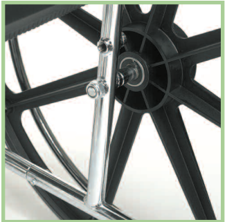
Dual axle Allows seat to be easily lowered to hemi height. Available on 2000, 3000 and 4000 models