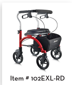
Item # 102EXL-RD