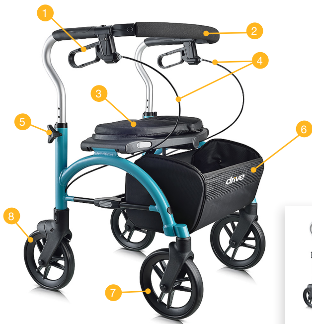
Item # 102EXL-BL