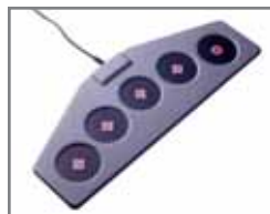
Actuator Lights Module Wafer Board(ALM)