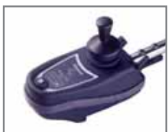
Remote Joystick - 5 program options