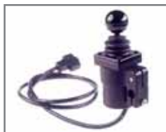
Mini Proportional Joystick