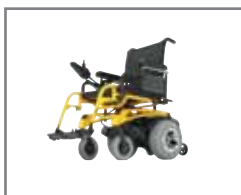
P-220: Classic Performance