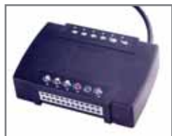
Actuator Lights Module (ALM)