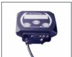
Universal Specialty Control Module