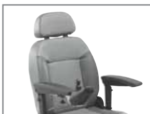
HIGHBACK CONTOUR (G-424, S-525, FREESTYLE)

The Quickie Power Series can be customized with a choice of seating options to offer the rider the ultimate in comfort and support.