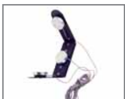
Tri-Switch Head Array