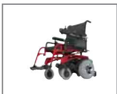
P-222 SE: Dynamic Power Base