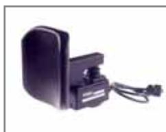
Proportional Head Control