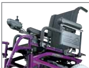
SEAT FRAME (G-424, S-525, P-222 SE, P-220, FREESTYLE)

The molded foam construction of the Contour Seat provides both support and comfort.