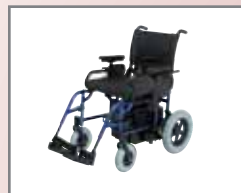
V-100: Light Duty Rigid Chair