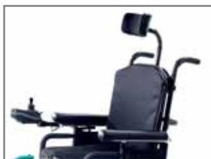
QUICKIE TRAX™ SEAT (S-646, S646 SE AND SMARTSEAT)

The Seat Frame seat is available in a variety of sizes to ensure a perfect fit for riders with more specialized seating needs.