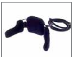
Proximity Head Array