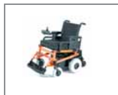
P-200: Classic Performance