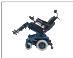
SmartSeat: Power Tilt and Enhanced Recline