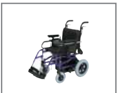
Z-500: Moderate Duty Pediatric Power Base