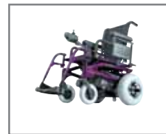
S-525: Standard Rehab Power Base