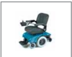
G-424: Center Drive Power Base