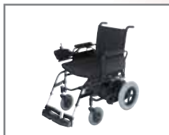
V-121: Light Duty Folding Chair