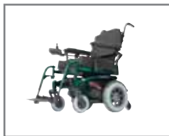
S-646 SE: Full Feature Rehab Power Base