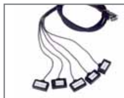
Zero Touch Switches (5)