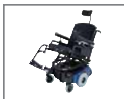
Freestyle: Dynamic Power Base