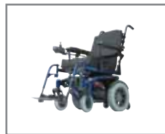
S-646: Full Feature Rehab Power Base