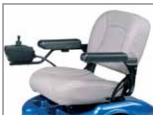
CONTOUR SEAT (G-424, S-525)

The Highback Contour seat optimizes support and allows for easy lateral transfers. The contour foam maximizes comfort and virtually eliminates bottoming out.