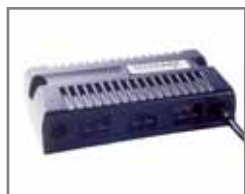
Power Control Module