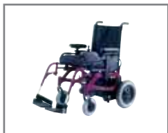
V-521: Moderate Duty Folding Chair