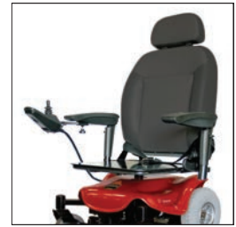
Pan Seat Option