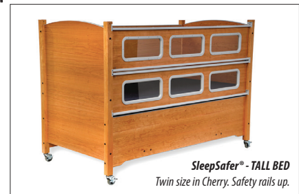
SleepSafer® - TALL BED Twin size in Cherry. Safety rails up.