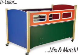
...Mix & Match!

SleepSafer® Beds are designed to address the issues of falls and entrapment for those with special needs. Models include SleepSafer® - Low Bed, SleepSafer® II - Medium Bed, & SleepSafer® - Tall Bed, each offering more safety rail to mattress height.