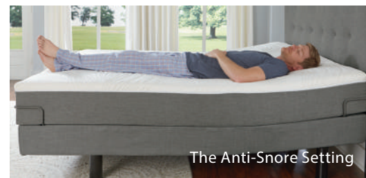
The Anti-Snore Setting