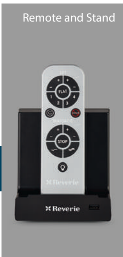
Remote and Stand