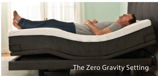
The Zero Gravity Setting

Reverie's® adjustable foundations provide unsurpassed quality, comfort and design.