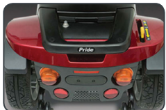
Full Lighting Package

The Pursuit ® incorporates a blend of power, style and performance to handle rugged outdoor terrain. The powerful drivetrain, 24 Volt, 4-pole motor for increased power, 3.56" ground clearance and maximum speed of 8 mph combine power and torque to accelerate your active lifestyle. Standard features include feather touch disassembly, wraparound delta tiller, 13" low-profile solid tires, front and rear suspension, high-back reclining seat, full lighting package, infinitely-adjustable tiller, front basket and rearview mirror. Available in Red and Silver.