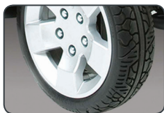
13" Low-profile Tires