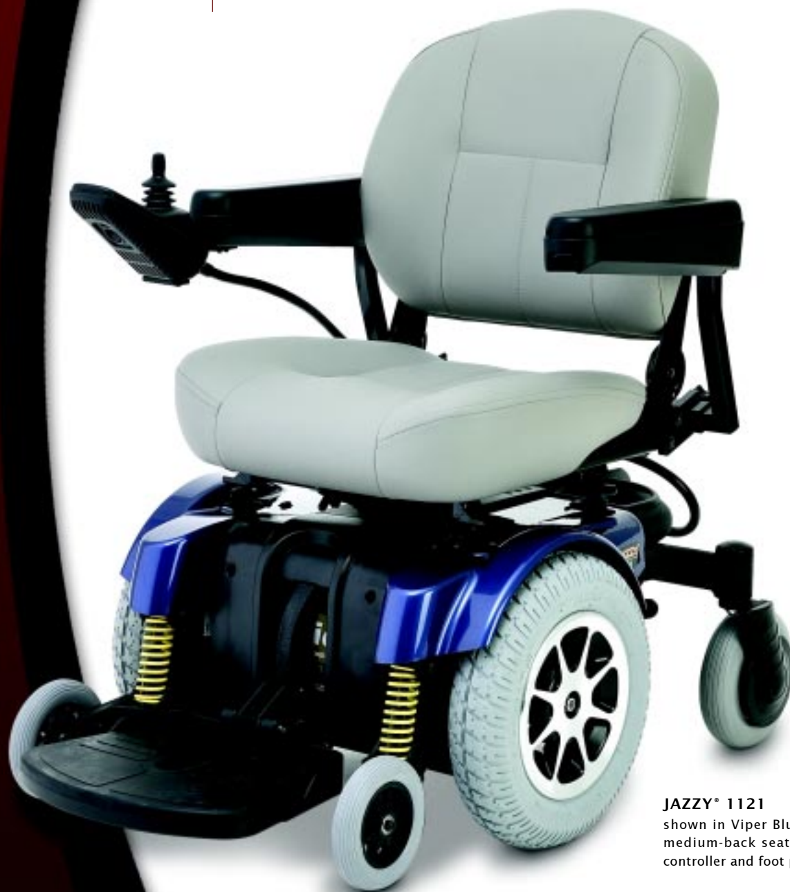
JAZZY® 1121 shown in Viper Blue with medium-back seat, PG VSI controller and foot platform

Tight-space indoor maneuverability is made easy with the Jazzy® 1121's compact overall size and mid-wheel drive design. Yet, the 1121 doesn't stop there. Outdoor performance—climbing and terrain transitions—is ensured through the use of Active-Trac® Suspension and the responsive action of the front anti-tips and rear casters. The Jazzy 1121 is the perfect power chair for your diverse and demanding lifestyle.