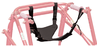
Soft Seat Harness

Adjustable padded pelvic support assists weight bearing, properly positions user's pelvis and provides freedom of movement.