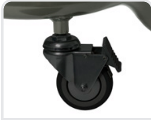
3" (75mm) front swivel casters lock