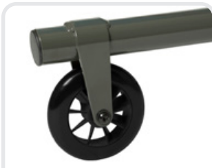
4" (110mm) fixed rear casters allow for easy access and keep the tray secure