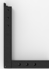
Class III No Drop