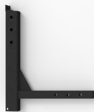
Class II 2" Drop