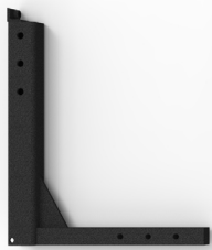
Class II No Drop