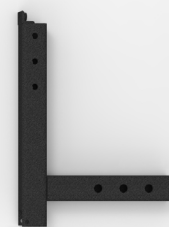
Class III 2" Drop