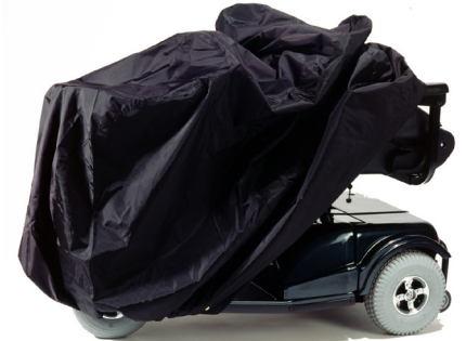
Scooter and Power Chair Cover