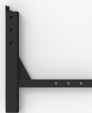
Class II 4" Drop