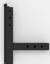
Class III 4" Drop