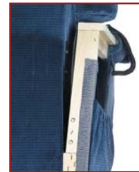
501 M shown

One size doesn't fit all with Golden Technologies seat lift chairs.