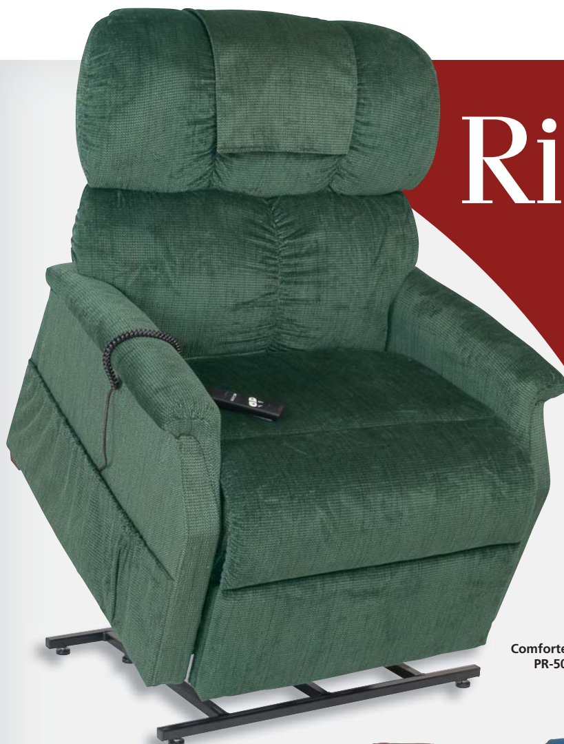
Comforter Tall Wide PR-501T-28D