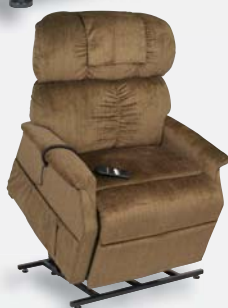
Comforter Medium Wide PR-501M-26D