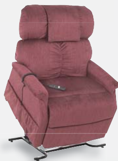
Comforter Large Wide PR-501L-26D