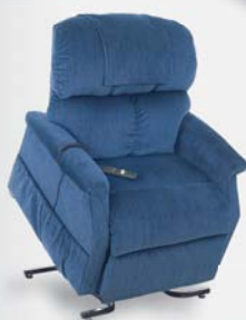
Comforter Small Wide PR-501S-23