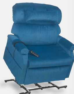
Comforter Super 33 Wide PR-502