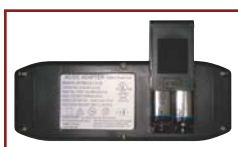
Battery Backup System

Sizes may vary depending on fabric, filling material, upholstery and carpet thickness. All measurements taken on concrete floor using levels and metal rulers.