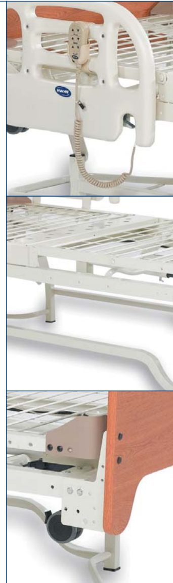
820-3MDLX Bed featured with Invacare® ThinkSoft® Positioning Device and Kendall Bed Ends

The Invacare® Carroll DLX Series 820DLX Bed is the workhorse of long-term care, offering proven, dependable performance at an affordable price. This durable bed includes features such as an expandable length deck, removeable bed-end brackets and a built-in hand crank so the bed can be raised or lowered by hand in case of a power outage, or if the battery runs out.