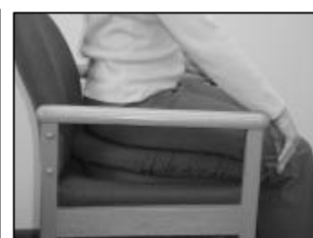
Raising the lifting cushion To rise from a seated position, gently pull upward on the power lever.