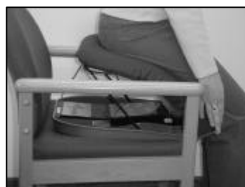
Lowering the lifting cushion To lower into a seated position, gently push downward on the power lever.

Note: Please remember that it is neither necessary, nor advisable to keep pushing/pulling on the lever once the motor has started.