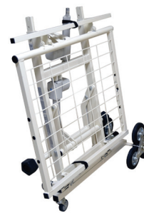
Transport Dolly and Stair Climber