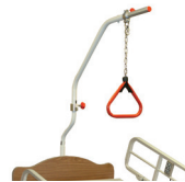
Trapeze Patient Helper