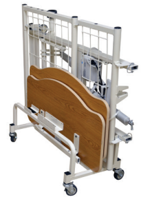
Storage and Transport Cart